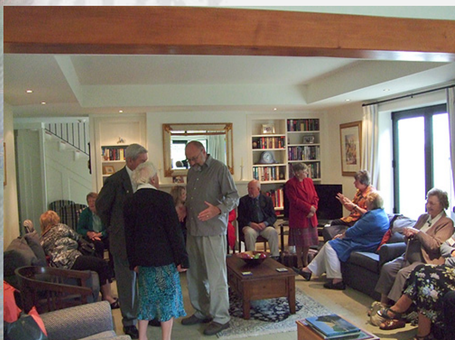
Members socialising after the AGM.